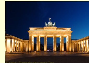
Berlin, Brandenburger Tor