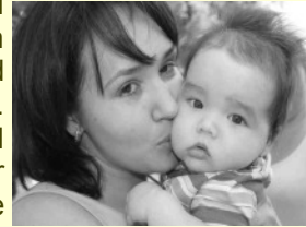
Au Pair in Germany

Applying for an Au Pair placement in Germany has never been easier. It is free of charge, confidential and easy to fill in. Simply download and fill out an application form ( www.aupair-germany.net ) and attach the required documents. You can either post or e-mail the application package to our address. Please attach the following documents: