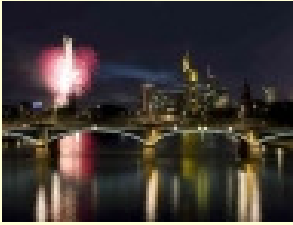
Frankfurt by night